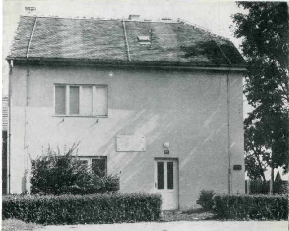
THE MEMORIAL MUSEUM OF THE FIRST CONFERENCE OF THE COMMUNIST PARTY OF CROATIA